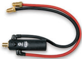
195380 50 mm Dinse-style gas thru with gas and water return lines for water-cooled torch.