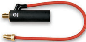
195377 50 mm Dinse-style with water return line for water-cooled torch.