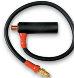
225028 50 mm thread-lock-style for water-cooled torch.